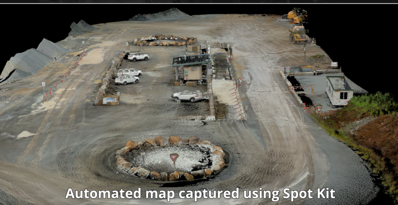
Automated map captured using Spot Kit